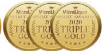
Taste: Cherry Lime (Highest Honors)